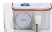
Replaceable battery and non disconnectable probe

PART NRS 12521 E : Nano SPY Référence 12521 X : Nano SPY Référence without battery