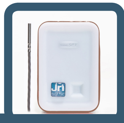
Non contractual photo

Standard measuring instrument for the Nano SPY range sensors