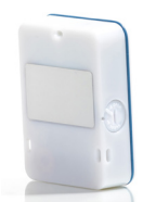
Fixing eyelets and integrated magnets