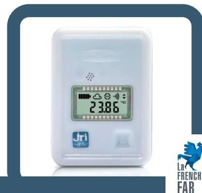
Non contractual photo

Temperature and hygrometry recorder with a long-range LoRaWAN™ connectivity